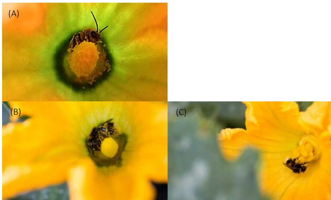
Figure 2(A) Eucera pruinosa visiting a staminate courgette flower for pollen, (B) Bombus terrestris visiting a staminate courgette flower for nectar, and (C) B. terrestris visiting a pistillate Cucurbita pepo flower for nectar. Fig. 2A was taken in California, United States, and Figs. 2B and 2C were taken in the United Kingdom. Fig. 2B and 2C © Daphne Wong.