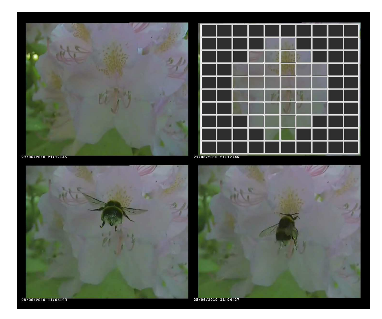
FIG. 2. Screenshots from recordings made of the rhododendron illustrating the video motion detection sensor. The upper left picture shows the camera view of the capitulum. The upper right picture shows the area that was masked (i.e. the dark grey square boxes). Only the unmasked area is sensitive to movements and triggers the recordings. In the lower left picture the approaching bumblebee that triggers the recording. In this case (picture lower right) it was a classified to B. terrestris / B. lucorum group.