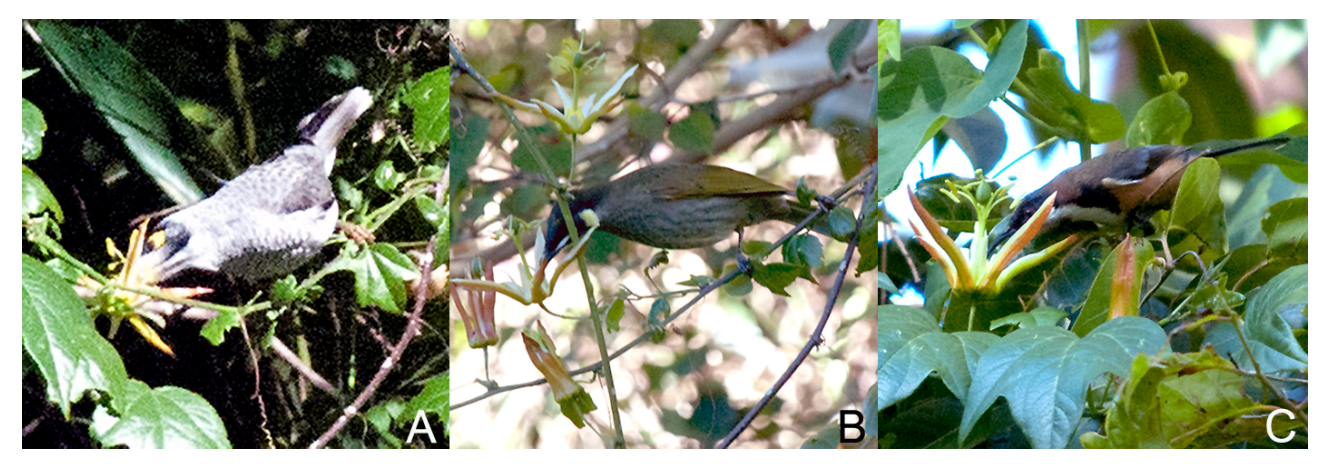
FIGURE 4. Floral visitors to Passiflora herbertiana. (A) Noisy Miner. (B) Lewin's Honeyeater. (C) Eastern Spinebill.

ovules (Delph & Lively 1989; Weiss 1995). Anthocynanins are often responsible for floral colour change (Weiss 1995), and provide UV protection to plant tissues (Mazza et al. 2000). Flowers exposed to full sun were salmon-coloured while those in shade were pale yellow. In full sun, anthocyanins may accumulate more quickly as a protective response. Most flowers received indirect sunlight exposure and accumulated pigmentation gradually as the flower aged (Fig. 2). Thus, colour change may serve a dual purpose as both a UV sunscreen and a signal to pollinators in P. herbertiana .