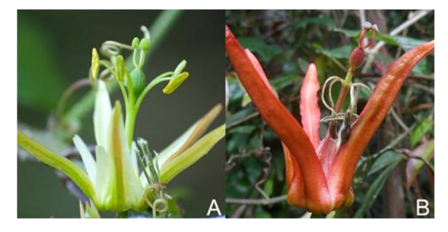
FIGURE 2. Short style morph in Passiflora herbertiana . (A) Young flower with short, erect styles that lack normal movement patterns. Note anther dehiscence. (B) Older flower with short styles that remain in original position and anthers that have released all available pollen.

Three flowers were observed with styles 4-6 mm shorter than normal flowers (Fig. 2); in these flowers styles remained fully upright throughout anthesis. No pollinations were performed with short-styled individuals. Both sun exposure and flower age are important factors contributing to floral colour in P. herbertiana . Regardless of age, flowers in full shade remain pale yellow, while those in full sun are salmonpink. In partial shade, colour and flower age are more closely correlated, where yellow (Fig. 2A) changes to salmon pink or reddish (Fig. 2B) during the final days of anthesis.