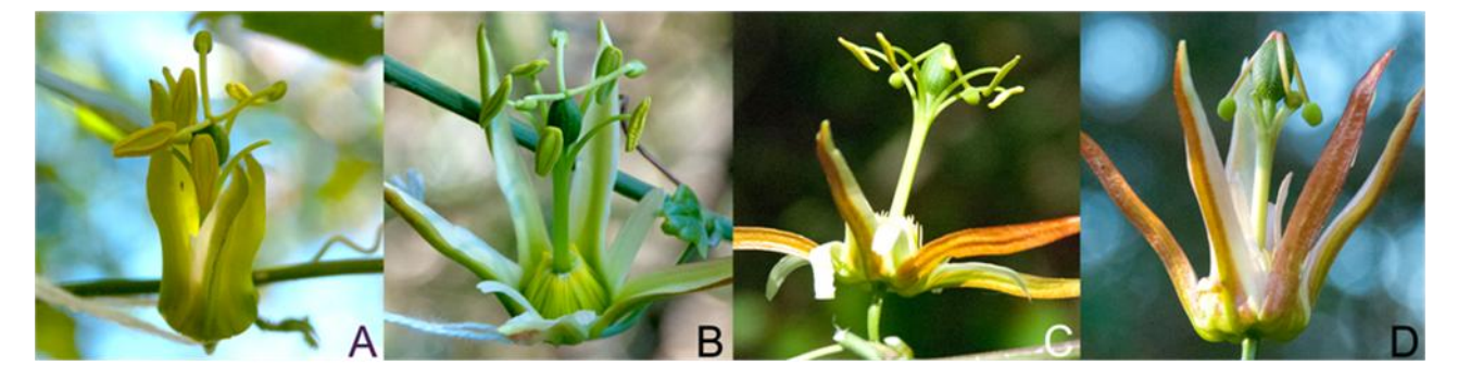
FIGURE I. Anthesis pattern of Passiflora herbertiana over five days. (A) Onset of anthesis: Sepals open I-2 cm in the afternoon, styles initially held at ca. 20° angle from androgynophore. (B) Next morning: perianth begins to open; anthers start to dehisce, styles will eventually become level with stamens. (C) 48-72 hours: perianth becomes fully expanded; the styles continue descent downward. (D) Last day of anthesis (stamens removed): perianth begins to close; styles fully extended downward, eventually curling around the ovary.

Floral buds take ca. 21 days to develop to maturity from initiation along the shoot tip. Most flowers opened overnight (N = 15), but a small number opened over the course of the day (N = 4). In night-opening flowers, the afternoon before full anthesis (ca. 16:00) sepals split to 1-2 cm at the apex (Fig. 1A), at which point the styles and anthers became visible. This was defined as the start of