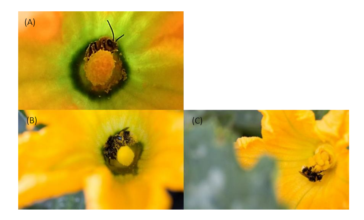
Figure 2(A) Eucera. pruinosa visiting a staminate courgette flower for pollen, (B) Bombus terrestris visiting a staminate courgette flower for nectar, and (C) B. terrestris visiting a pistillate Cucurbita pepo flower for nectar. Fig. 2A was taken in California, United States, and Figs. 2B and 2C were taken in the United Kingdom. Fig. 2B and 2C \bigcirc Daphne Wong.