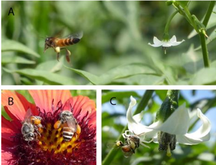
Figure 3. The three most common flower visitors A) Apis dorsata B) A. florea and C) Tetragonula irridipennis coll. (predated by a crab spider in the photo).